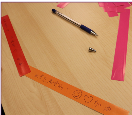
'The world is full of love. We have your back!'