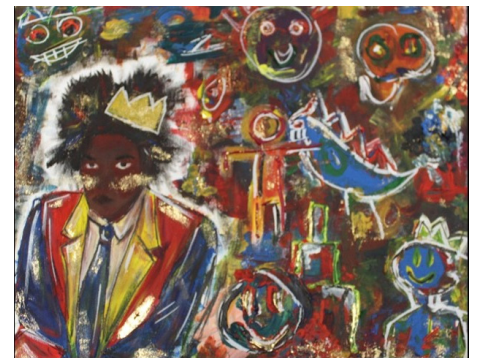
Winning piece by Futura (7E)